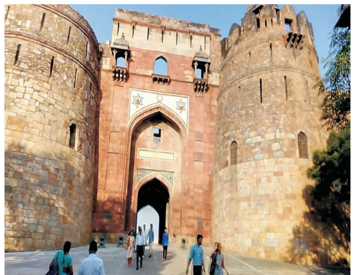
Purana Kila of Delhi.

Mahabharat is one of the two famous Indian epics. It is the story of a war that could merely be mythological, or could even be a story of a real war that took place in a year somewhere in the wide range 5500 BCE to 500 Common Era . In the negotiations before the war, one of the parties – the Pandavas – are willing to give up their rights on everything else if they are given just five cities. The names of all these five cities ended with the letters 'prastha'. Indraprastha was one of them. It was the capital of the kingdom led by the Pandavas. Modern historical research pins its location in the region of present-day New Delhi, particularly the Old Fort (Purana Qila). Interestingly, the other four cities retain their ancient names - Sonipat, Panipat, Baghpat, and Tilpat - albeit in a form that is slightly easy on the tongue.